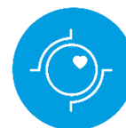
role in society

We are convinced that our strategy – powered by our culture and the efforts of our people – helps us earn, keep and grow trust day by day and, therefore, gives us the capacity to become the reference in our core markets.