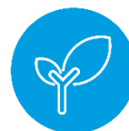
sustainable profitable growth